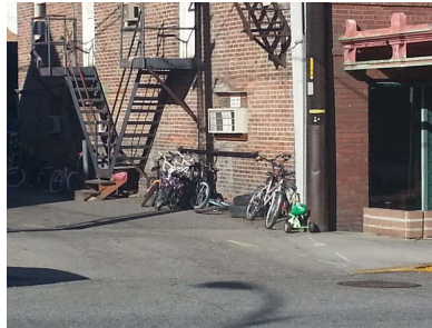
Photos of children's bicycles at a local, transitional housing development

Reduce & alleviate the impacts of homelessness on individuals, families and the community of Wenatchee by creating Permanent Supportive Housing